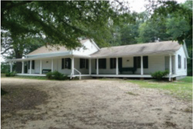
Meeting House built 1851