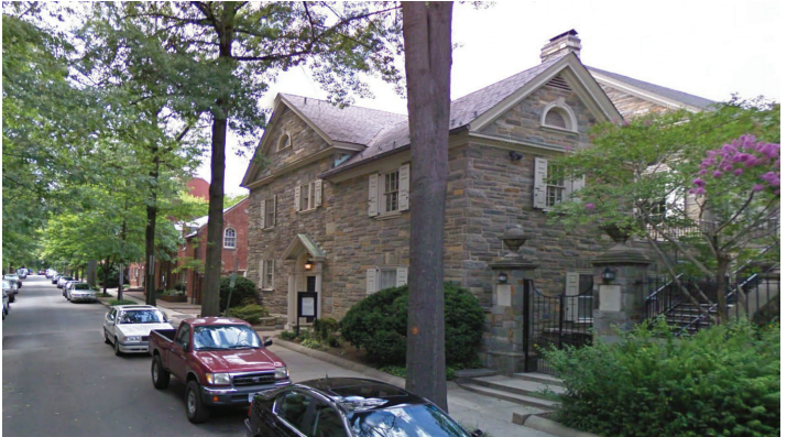
Meeting House built in 1930