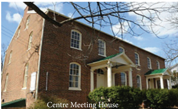
Centre Meeting House

Established Worship Group 1734 Became Monthly Meeting 1735