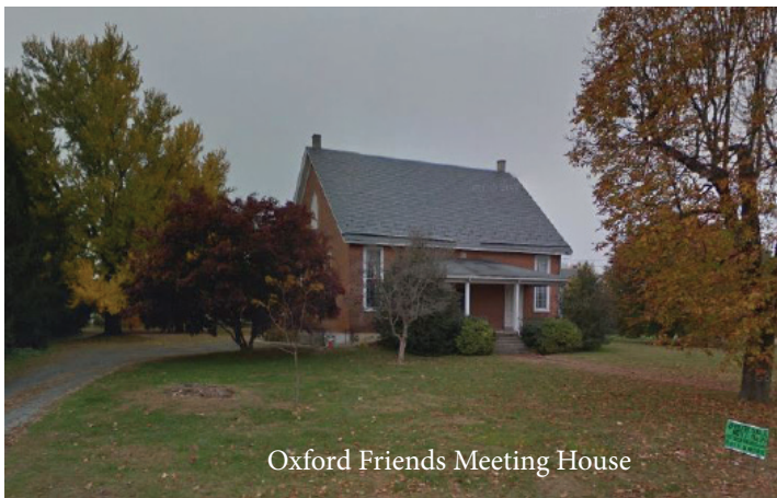
Oxford Friends Meeting House