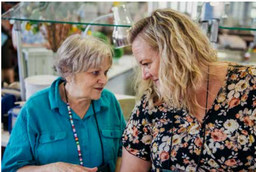
Annual Session 2018

Our Meeting's Unity with Nature committee recently replaced every light bulb in the building we rent with LED bulbs, with the owner's blessing. Also, its members toured the large recycling facility that handles recycling for Howard and Anne Arundel Counties. Seeing the Latina workers standing at fast-moving conveyor belts