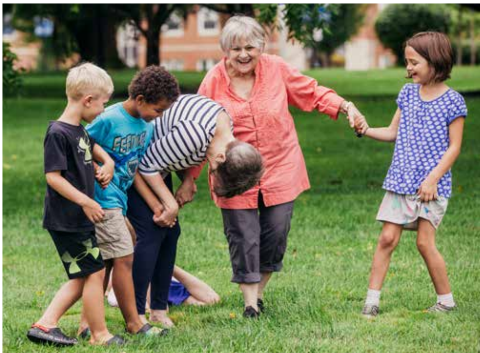
Annual Session 2018

people to gendered activities that align with their identities (if you can't eliminate gendered activities all together); provide resources and information that are affirming of trans and gender non-conforming people; keep trying, even when you mess up!"