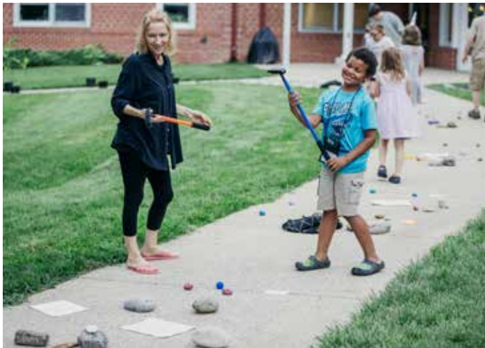
All-Ages Celebration mini-golf Annual Session 2018