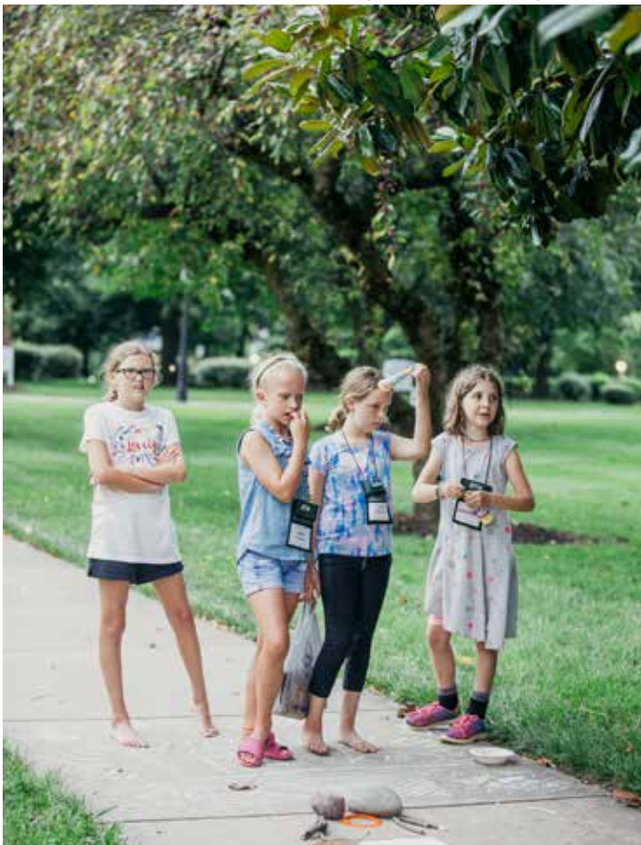
Annual Session 2018