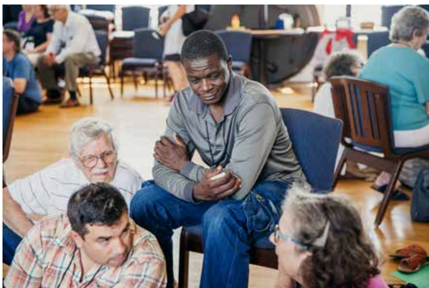
Intergenerational Plenary Session Annual Session 2018