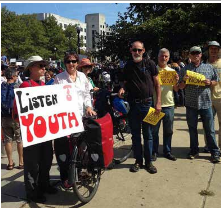
Baltimore Yearly Meeting Friends at September 2019 deep strike.

for Future movement. How great it is for her to feel seen, heard and understood, surrounded by youth who are taking action on climate change.