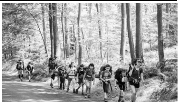
Campers on the trail

Annapolis Friends also sponsored a table at the annual Kunta Kinte Festival. This was an opportunity to share our commitment to equality and stewardship as well as participate in other outreach like registering new voters and sharing green initiatives. Attendees were happy to make