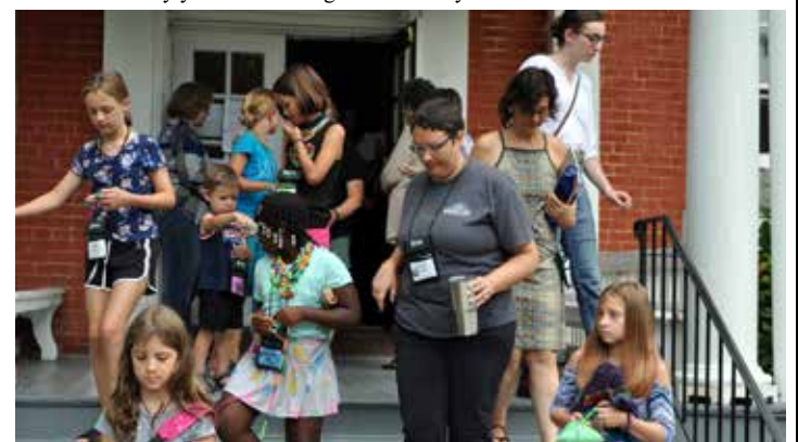
Junior Yearly Meeting exiting Business Meeting at Annual Session 2019