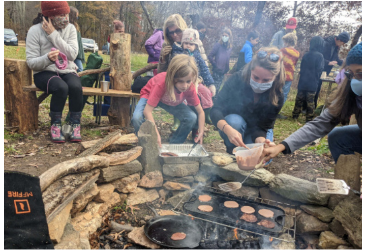
Sandy Spring Monthly Meeting Members cook acorn patties over a fire

Who was it that said, If you build it, they will come? Come spend time with us this summer. We've reserved a special prayerful place for you.