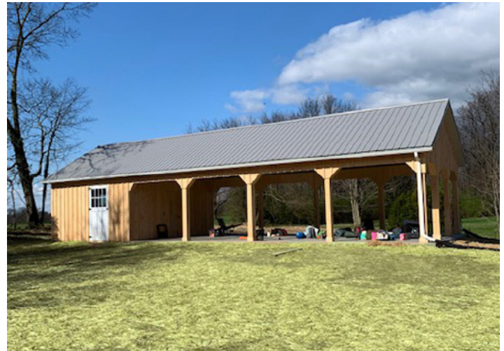
Hopewell's new picnic shelter

In the last several months, we have expanded our Meeting for Worship opportunities. We now are holding weekly blended (in-person and Zoom) Meeting for Worship at 11 am, using an Owl, laptop, and large television monitor in the meetinghouse. We are happy to stay connected with each other through technology, and sometimes struggle to find enough tech volunteers each week. We also now have weekly in-person 8 am Meeting for Worship, a particular joy for longtime regular attenders of Early Meeting. In March,