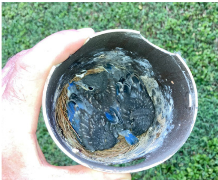
Baby Blue Birds found at Sandy Spring Monthly Meeting

Our committees are active and nourishing our community. RE program is busy with toddler to elementary age children who now participate in the first 15 minutes of meeting for worship before they go to their classrooms for programs. Recently the RE Committee had a successful children's book drive. The book donations will be given to Helping Hands and FRIENDS Association for Children.