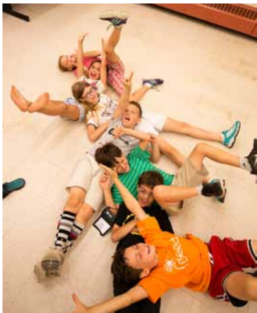
Annual Session 2014