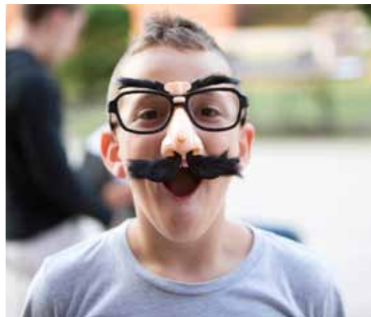
Annual Session 2014

We are looking forward to hosting the group Cycle4Gaza on Saturday, Sept. 20 as they stop to rest on their bicycle ride from Philadelphia to Washington DC. Cycle4Gaza, founded by a group of concerned young people in the wake of the 2009 war on Gaza, seeks to raise awareness about the ongoing blockade on the Gaza Strip and to raise critical funds for carefully selected non-profit organizations that work to support education and healthcare for Palestinians living under occupation and as refugees. Since 2009, they have organized cycles covering over 1800km across the UK and France, Italy, Jordan, Turkey and Germany and raised over 650,000 GBP (British Pounds) in support of healthcare and education projects in the Gaza Strip and in Palestinian refugee camps in Lebanon. This year several BYM Young Adult Friends are participating in the ride.