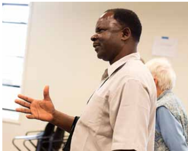
Annual Session 2014