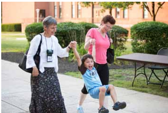
Annual Session 2014

Many meeting members read "The New Jim Crow," an experience that, combined with our prison ministry, has led to a deep commitment in many members to contribute to prison reform. A group of Friends continues to meet monthly to seek the way forward. Others of us have joined an alliance of organizations led by members of Annapolis Friends Meeting that is working on prison reform in Maryland and plans to work with legislators toward change.