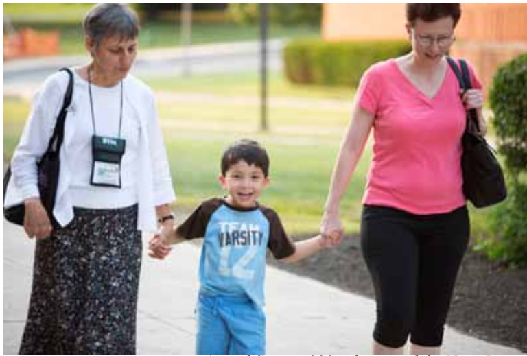
Annual Session 2014