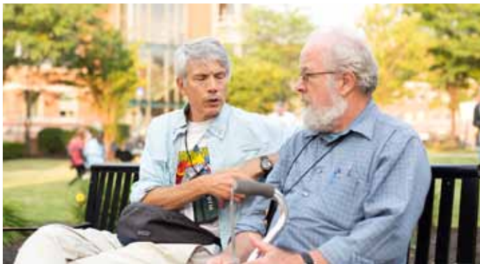
Annual Session 2014