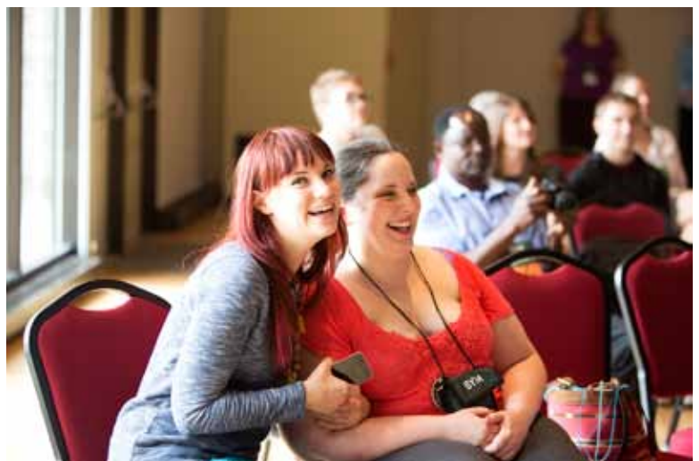
Annual Session 2014

Friends met again in November at Friends Meeting of Washington