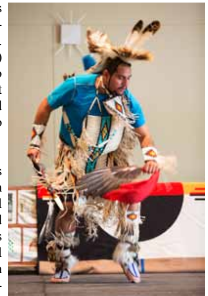
Annual Session 2014

In the coming months, members of the UWN Committee will be contacting local meeting clerks and/or liaisons. Committee members are willing to travel to meetings who request a visit.