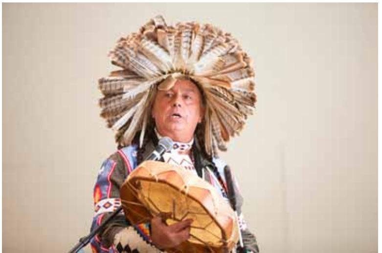
Annual Session 2014

Our Meetings for Worship with a Concern for Business moved us toward healing and transformation. We approved a minute on inclusion, affirming the right of all individuals, including transgender people to understand and express themselves with authenticity and integrity. We shared our deep concern for the child refugees crossing the United States border, for those who are unjustly incarcerated, and for those who are suffering in Israel and Palestine. We agreed to bring back to our meetings a concern for climate change, resource depletion, and environmental degradation. We welcomed our new Development Director, and approved our first ever capital expenditure budget. Together, we worked on building a “mini cabin” as a fundraiser for our camping program. We heard of the “ministry of presence” that will be the focus of our longstanding inter-visitation program, and received a report from our Vision Implementation Committee, urging us to take simple, achievable steps to strengthen