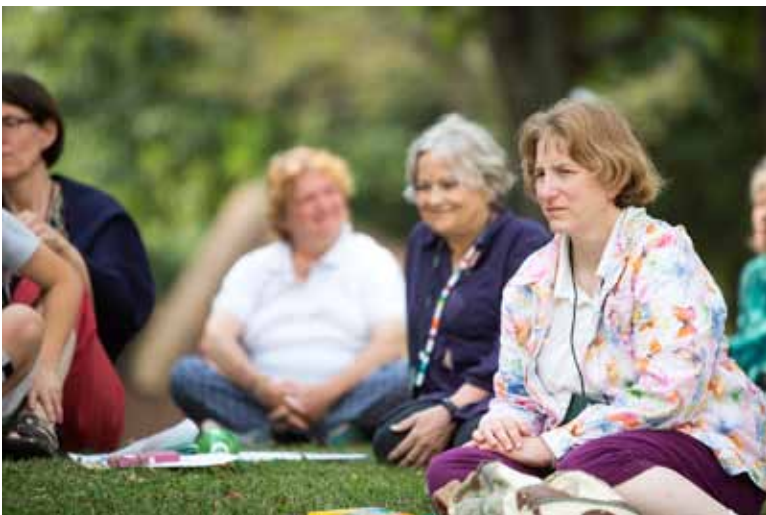
Annual Session 2014

With love, Baltimore Yearly Meeting Women's Retreat