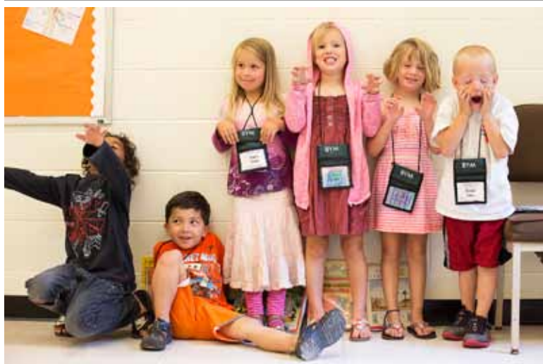
Annual Session 2014