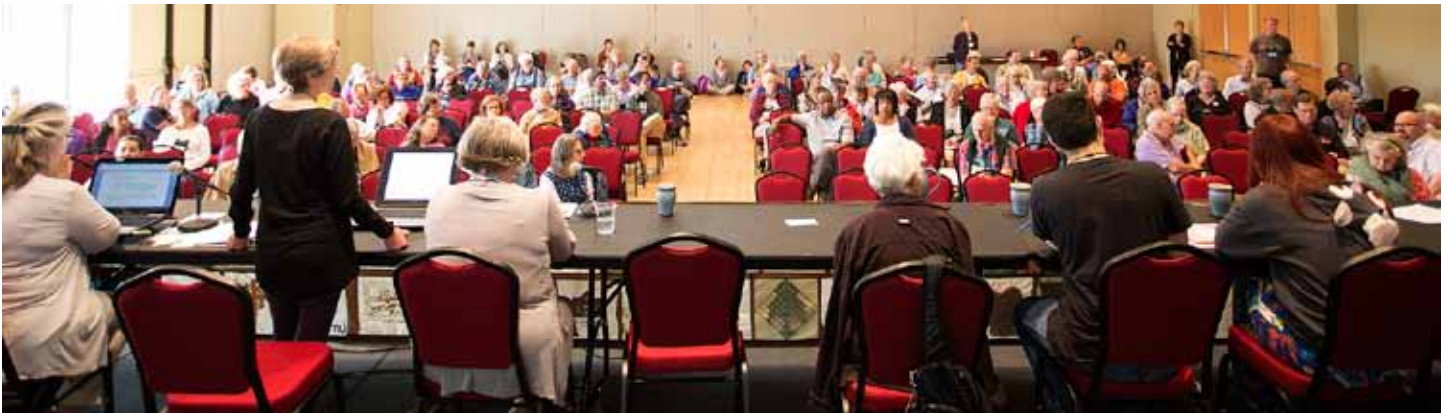
Annual Session 2014