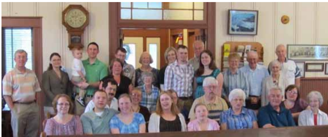
West Branch Friends

Centre Monthly Meeting authorized an Indulged Meeting for Worship in Clearfield County on December 17, 1812 to be known as West Branch. Worship continued in homes until the first Meeting House was built in 1824. At this time, Centre Monthly Meeting approved West Branch as a Preparative Meeting, which means that it could conduct its own business with approval of the parent meeting. In 1833, West Branch was given Monthly Meeting status to stand alone.