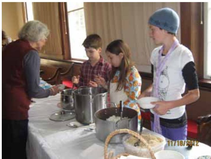
Maury River Simple Meal.