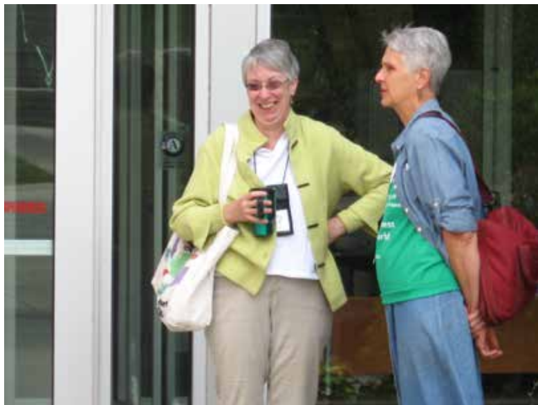
Annual Session 2015