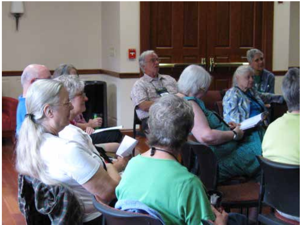
Annual Session 2015

I understand that I will be an ex officio member of BYM’s new Healthy Organization and Purposeful Evolution (HOPE) Committee that will be undertaking a continuing organizational review and making recommendations to support our continuing this journey. I think it is part of my role to meet with you and to work with your officers, committees, and members to help discern how this journey takes us; to help formulate some improved pathways for the journey; to focus on how your staff (including your next general secretary) can best serve you; and on how we can best nurture, organize, manage and support our staff in helping fulfill your mission and vision.