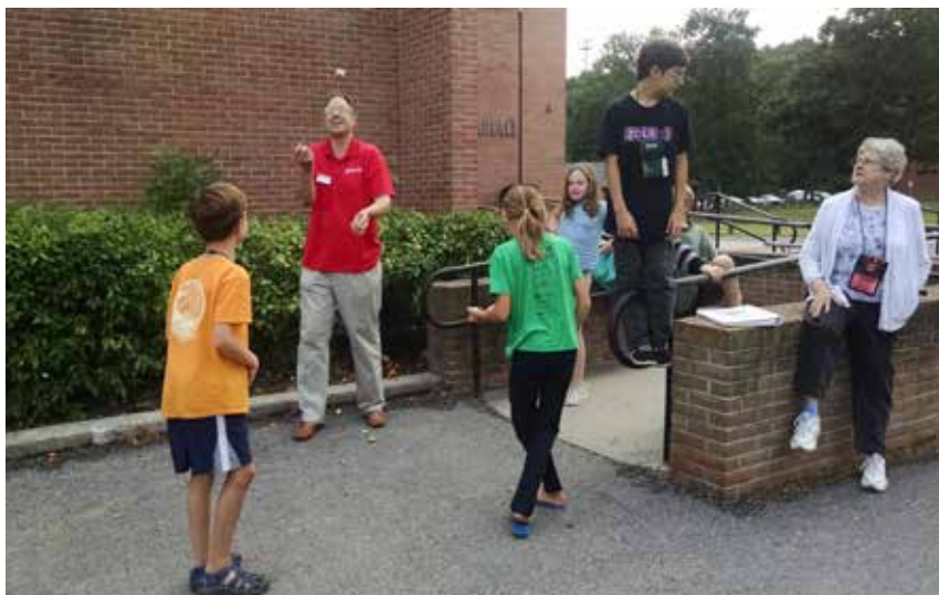
Annual Session 2015

Today BYM numbers around 7,000 members and attenders from 42 Monthly Meetings with 53 locations in Maryland, Virginia, Pennsylvania, West Virginia, and the District of Columbia. You have 25 committees and working groups served by hundreds of very active volunteers. BYM is affiliated with schools, retirement communities, assisted living and long-term care facilities, and a wilderness center; and we have representatives on and working relationships with Quaker organizations throughout the United States and around the world. We own or lease three camp properties in Maryland and Virginia, our office in Sandy Spring, and a large number of active and inactive Meeting Houses, cemeteries, and