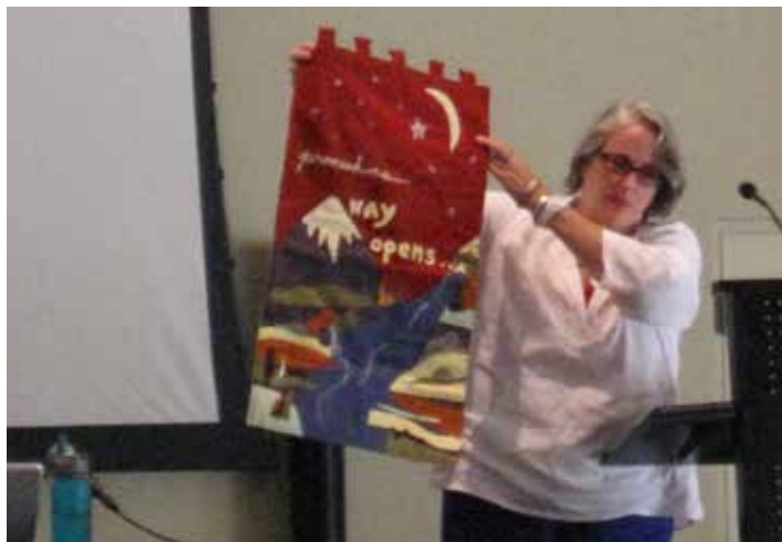
Annual Session 2015

Emotions run high about sports team names, mascots, and fan ‘traditions,’ yet one can take a principled stand even if it will be controversial. Young people can be role models for adults. We invite Friends to look to their own lives for ways to encourage respect for