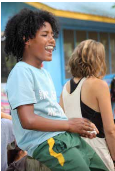
BYM Camps 2015

Where exactly was the Fine Creek meetinghouse located? Was it in the hamlet surrounding the gristmill; or, was it in the surrounding countryside? Why was the Fine Creek Meeting “laid down” after existing for 34 years? One can only hope that as ancient records become more searchable due to digitization, someone will be able to fill in the missing pieces to this local Quaker mystery. Maybe it will be YOU!