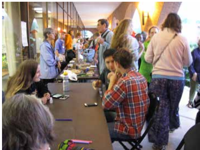
Annual Session 2015

Consider talking to businesses that prominently display the DC team name about your discomfort. (Businesses recently responded to public pressure to stop displaying and selling the confederate flag.) Consider speaking up when a friend or colleague wears Indian-related team merchandise, using it as a teachable moment to say, “I’ve come to understand that such logos or symbols or words are offensive to many Native Americans.” Remind them of non-disparaging names such as the Baltimore Ravens or Philadelphia Eagles and mascots such as the University of Maryland terrapins that both Native and non-Native people can happily support. We don’t have to just go along with the crowd.