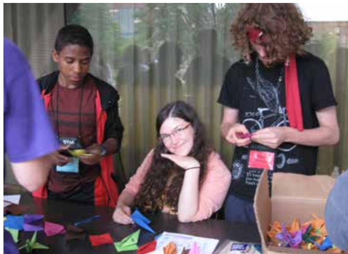
Annual Session 2015

Meeting about the way their careers reflected their Quaker values. Our Friendly 8’s groups – one for adults only and one for families, continue to meet for potluck dinners and discussions. In May, we had a service day at Wider Circle, a non-profit organization in Silver Spring which assists individuals and families transitioning from shelters to more stable living situations. We are blessed to have a community so rich in collaboration, cooperation, and exploration.