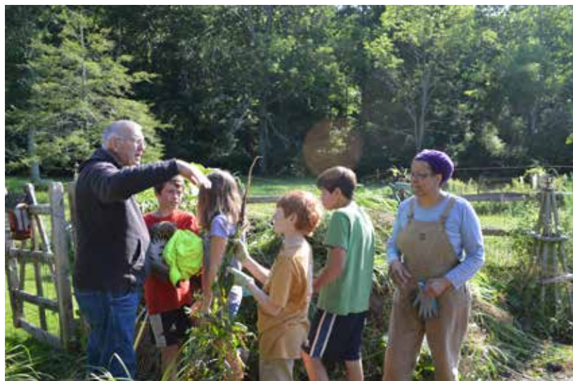
BYM Camps 2015 Park in Crozet.

The Meeting has completed one major repair project and another beautifying project at the meetinghouse. Several months ago mold was discovered in the kitchen walls, and inspection showed that the flat roof had been installed poorly so that water had been allowed to flow into the structure. After much difficult labor and weeks of being without a kitchen, the walls and roof were replaced, and we are mold free. At the same time, a beautiful memorial garden was constructed outside the meetinghouse with pergolas, benches and plantings. Thanks to the hard work of many Friends, both projects were completed efficiently and economically.