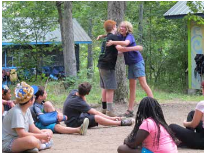
BYM Camps 2015

The Indian Affairs Committee pointed out that the National Football League’s Rule Book prohibits “using abusive, threatening or insulting language” and “using baiting or taunting acts or words that engender ill will.” Yet, the NFL has violated its core principles by