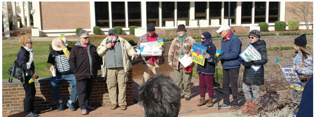
Quaker House Stand for Peace in Ukraine Event

Quaker House is thriving because of the support we receive from member meetings, other Quaker and like-minded organizations, and individuals. Baltimore Yearly Meeting contributes $200 annually and several local worshipping communities make significant contributions of their own. Charlottesville and Richmond Friends Meetings have been staunch supporters for many years. If you would like to follow and/or add to your support of our peace work, please visit the Quaker House website, Facebook page, Twitter or Instagram account.