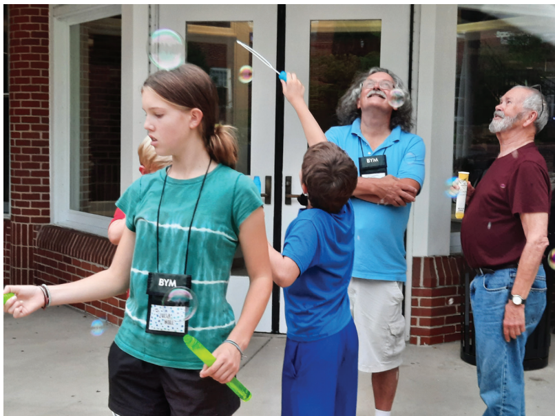
All Age Celebration at Annual Session 2022

We cosponsored four webinars and promoted them widely within BYM: Drone Warfare (organized by Annapolis Friends); Nuclear Weapons and What We Can Do, featuring activist and scholar