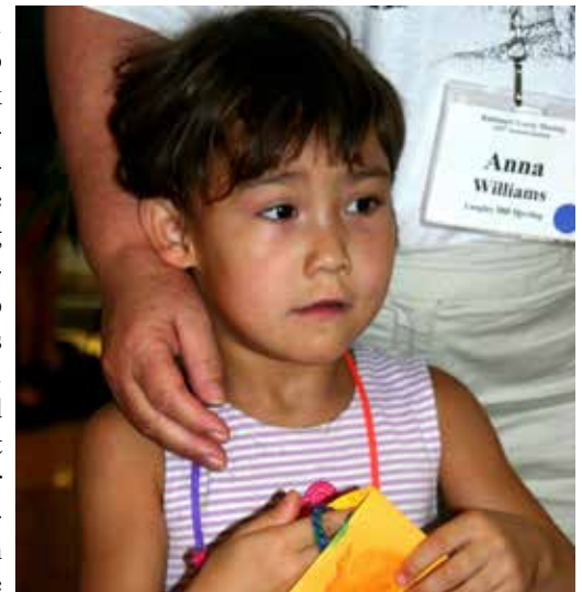
Annual Session 2005

Social hour. Some people do not like to talk about the messages after Meeting, but I have found talking about the preceding worship often promotes spiritual dialog. I have also heard the complaint that coffee hour can seem too superficial. When can we engage in deep spiritual