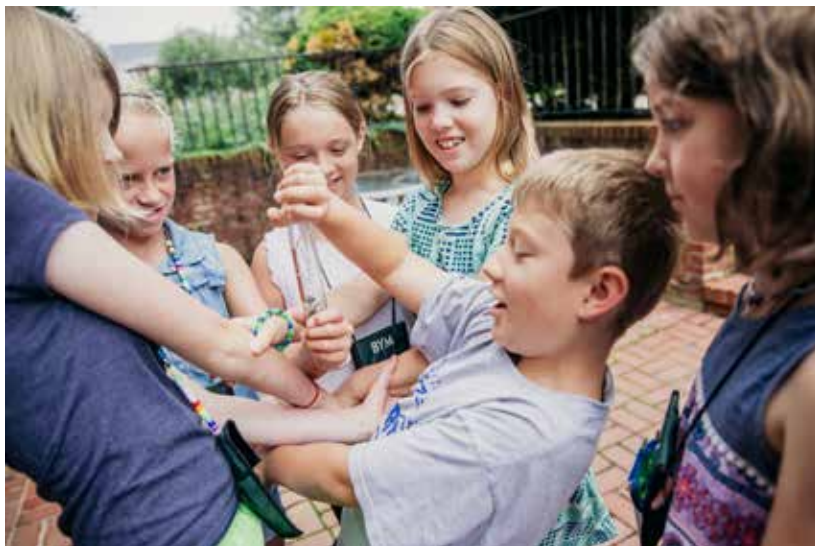
Annual Session 2018