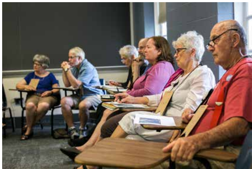
Annual Session 2017