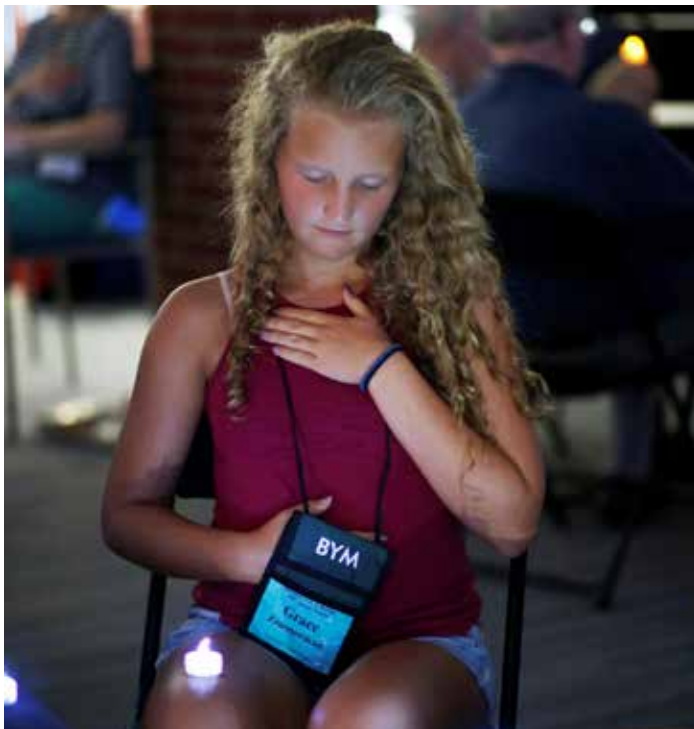
Annual Session 2016

There is surprisingly little written about how to listen to messages in Meeting for Worship, as if listening is so easy that nothing needs to be said. I maintain listening is a spiritual discipline that needs to be practiced mindfully and with as much intentionality and discernment as settling into the silence or speaking.