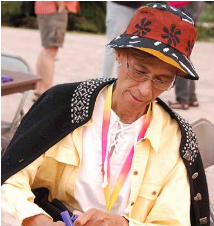
Annual Session 2008

In addition to our traditional Unprogrammed Worship, weekly Programmed Worship is timed to overlap with First Day School and Simple Lunch. This worship is largely attended by members of African Meetings, many of who have now joined Stony Run.