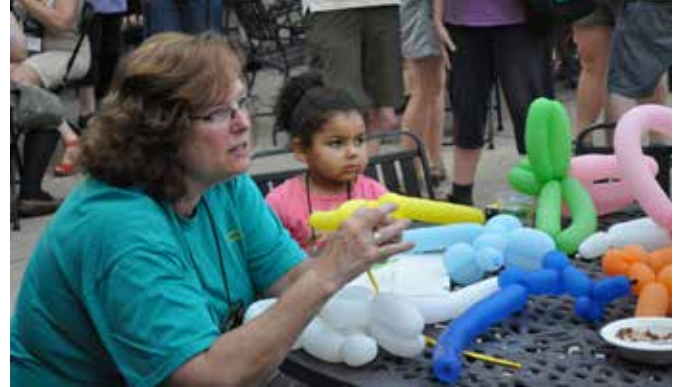
Annual Session 2019

You are joyfully invited to join the 2021 Annual Session of Baltimore Yearly Meeting. This session is being held virtually again this summer, as much as we still miss seeing each other in person. The Program Committee has thoughtfully arranged times when we will gather to worship together, do our corporate discernment for business, and spend time in community learning and deepening into our spiritual practices. Our theme this year, Seeking Wholeness: Knowing Our Shadow and Our Light , will guide us as we listen to each other, hear from our plenary speakers, and attend the opening retreat, workshops, and worship sharing. Though we will not be sharing dormitories or dining halls, we will gather in groups large and small to celebrate our faith, our community, and the gifts we each bring to each other.