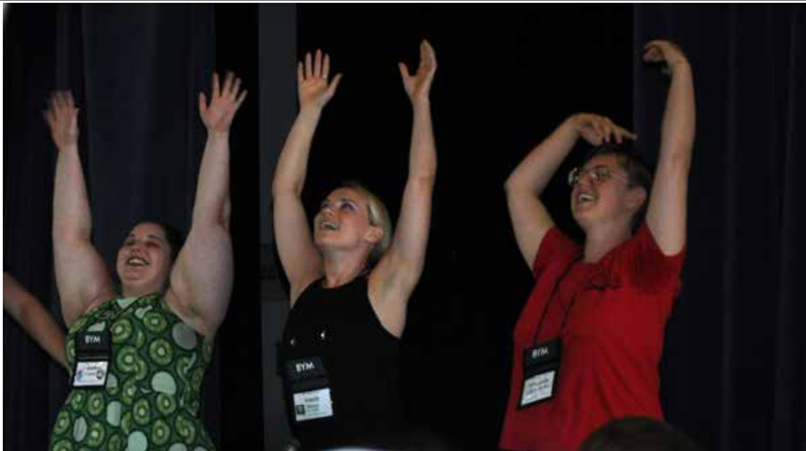
Young Adult Friends Plenary at Annual Session 2019

The Young Friends are not planning to hold meetings for business or other programming during Annual Session 2021.