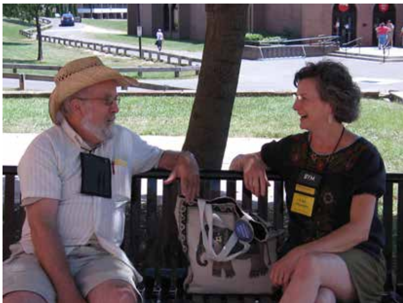
Annual Session 2015

arrived by horse and buggy, a circular driveway to accommodate drive-through visitors, eager children and accommodating parents and Friends. DCFM staged a live nativity scene to raise the spirits of members and the community alike. The exuberance was particularly evident among the participants who arranged lighting, costumes and props, dressed wise men and shepherds, and procured live animals, including donkeys, sheep and a baby goat. The camels were cardboard cutouts with soulful expressions that the Magi maneuvered as they arrived at the manger. The star of Bethlehem shone down on Mary and Joseph and the Babe. A chorus of adults sang traditional Christmas hymns and teens handed out candy canes (with kitchen tongs!) And paper ornaments to departing guests. It was grand! But, more importantly, it brought much needed Christmas spirit to many who had been home-bound and facing a pared-down holiday. The