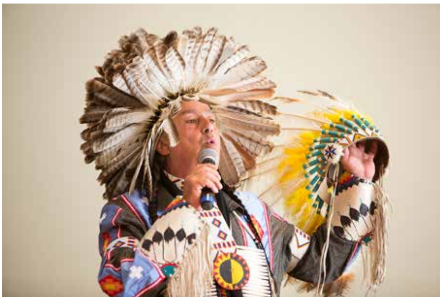
Annual Session 2014 Plenary Session

Since March, 2020 the Richmond Friends Meeting House has been closed due to the Covid-19 virus pandemic. Our first day Worship and most community activities have occurred online right up to the present time. By using Zoom we have been able to stay connected with each other and