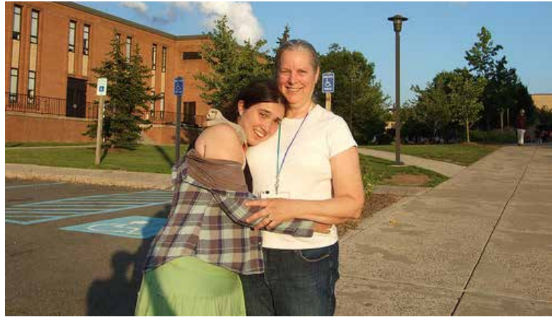
Annual Session 2009

In the midst of this heartbreaking pandemic, Hopewell Centre Meeting has found creative and prayerful ways to heal and attain wholeness. With the help of technology and savvy members, our new "hybrid" Meeting allows a safe number of us to meet in person at Hopewell meetinghouse while