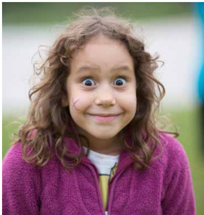
Annual Session 2013

Deer Creek Friends Meeting was possessed of a brilliant idea! How to present the tradition Christmas program in a time of reduced attendance, covered faces, and social distancing was the dilemma to be solved. Once the brilliant idea was suggested, thoughts rolled in, tumbling one upon another. We would use the resources with which we were blessed: a stable from the days when Quakers