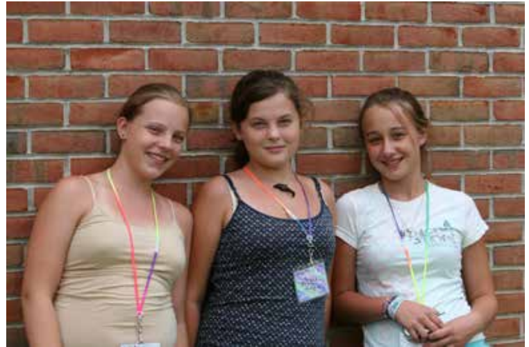
Annual Session 2007

Several major projects have occupied our community time. The first is a series of "Quakerism 201" Second Hours based on the development of a set of recommended practices and queries for Quaker discernment and decision-making in our Meeting. This project grew out of difficulties that arose during two of our Meetings for Business last summer. A joint effort of our Continuing Quaker Education and Ministry & Worship committees has helped to transform a serious difficulty into a joyful opportunity to work together to bring forth our highest aspirations for decision making as we sit together with the Spirit.