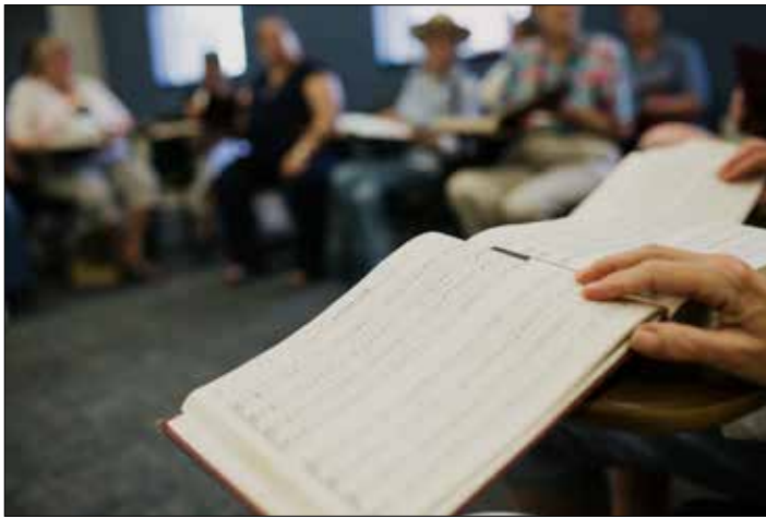
Annual Session 2016

When the family wanted to move to the opposite end of town, our members pitched in with two pick-up trucks and five people. Several others took the children to and from their new school for two weeks before they moved. Members generously donated a couch, dining table and chairs, a computer, five sewing machines, 4 of which were further donated to a sewing class for refugees, various other items as well as food. In addition, thanks to financial donations, we have paid their utilities and will continue until at least July of this year, plus some extra financial costs related to their move. Looking forward to a “typical Thanksgiving” potluck at a member’s home, we celebrate these new friendships we have formed with this couple and their two winsome children. They won’t always need our help, but our friendship with them will continue.