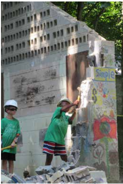
Bathhouse Day of Destruction