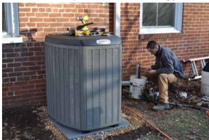
Valley’s New Heat Exchanger