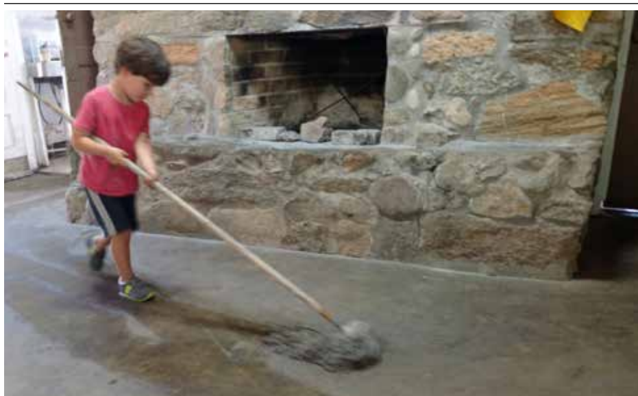
A future camper cleans the Thunderdome during the 2016 Shiloh Quaker Camp Reunion

This ability, this desire, to seek the quiet of the Spirit even amidst noise and activity, celebration and distress, is key to our journey as Friends. It is because we can fall into these wonderful moments of silence that we can find our way as Friends – we can find peaceful solutions, workable plans, loving responses, where we once had thought these things were impossible. And we can bring about real change, not only in the world, but in ourselves.