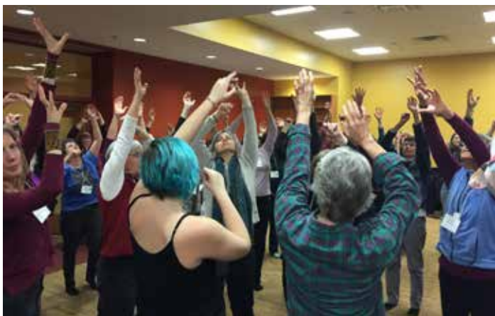
Womens' Retreat 2016