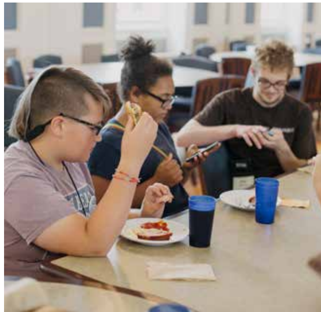
Annual Session 2016

White Privilege: let’s talk —a four-part curriculum published by the United Church of Christ in 2016 and being used by congregations around the country as part of that denomination’s “Sacred Conversations on Race.”