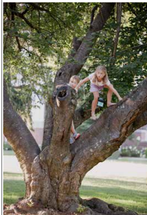
Annual Session 2016

Since last spring, Richmond has been assisting a refugee family from Iraq. Members of Meeting were excited about this opportunity to help a family get acclimated to our country and have been generous with time, money and other things needed by the family. The family had been given a good start with help from Catholic Charities, Reestablish Richmond, and International Rescue Committee, but needed more person-help from a community group like ours. Transportation was an immediate first need as the family does not have a car; we have responded with rides to doctor and social service appointments, shopping for groceries and school supplies.