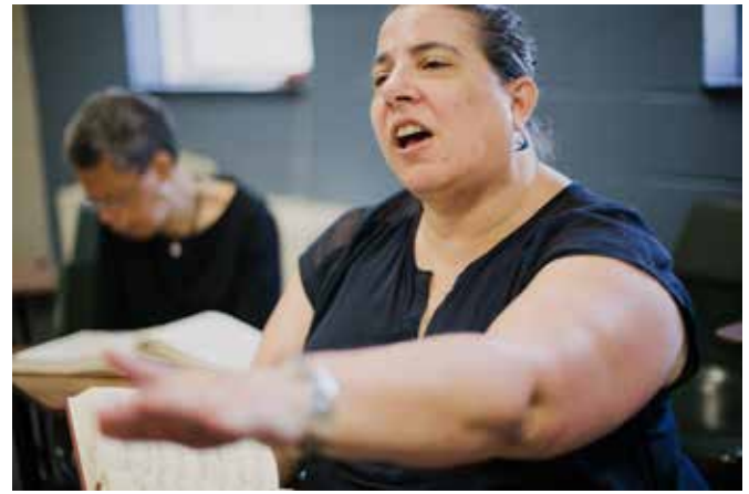
Annual Session 2016

During our second Called Meeting, the messages began to cohere