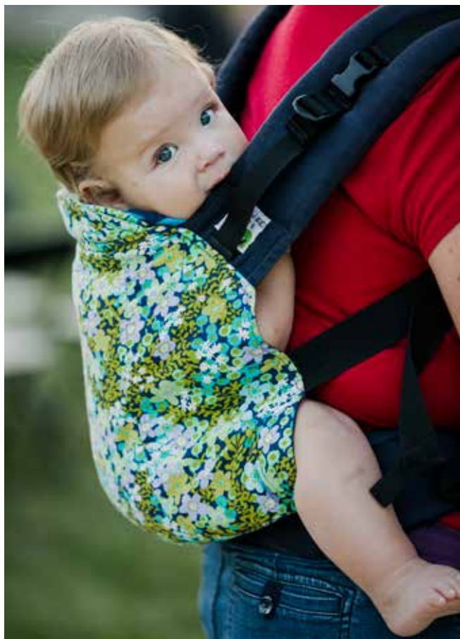
Annual Session 2016

Anyone interested in doing this work in his or her local Meeting can contact the Working Group at wgr@bym-rsf.org and keep your eyes peeled for more resources on the new “Change Group” page on BYM’s website—coming in 2017.