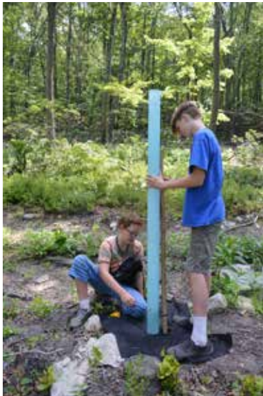
Tree Planting with Unit 1 at Catocin Quaker Camp

To launch us BYM Quakers into action with a little momentum, UWN vetted carbon calculators, some of which are reasonably accurate - and even