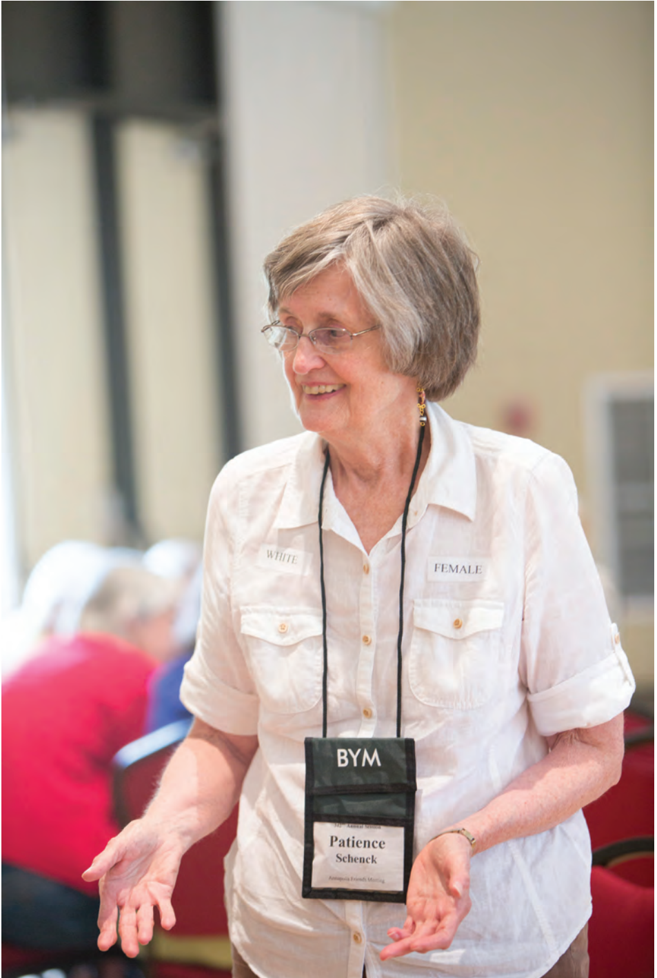
Annual Session photograph by Nony Dutton