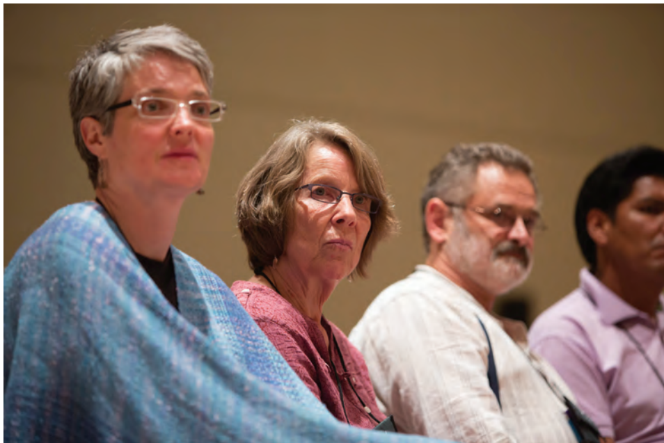
Annual Session