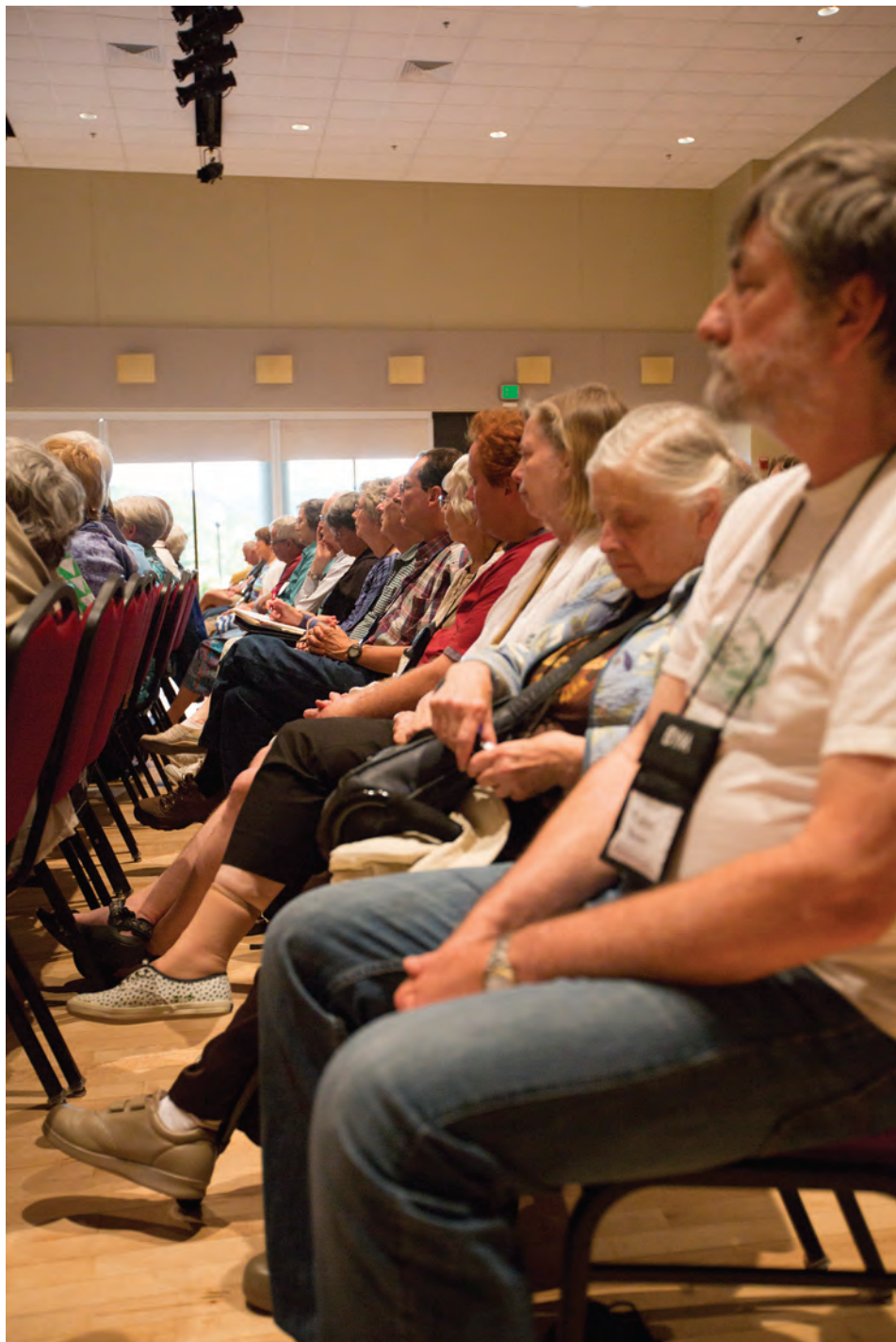
Annual Session