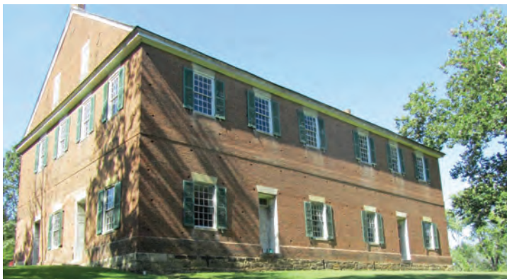
Mount Pleasant Meeting House.