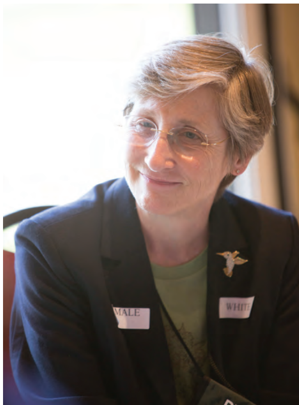
Annual Session

I have heard Friends express thanks to our Faith and Practice Committee for all their hard work and for the humble way that these Friends have visited Meetings and have listened to all the comments and concerns of Friends along the way. We owe this Committee a deep debt of gratitude for their careful, loving and humble work.