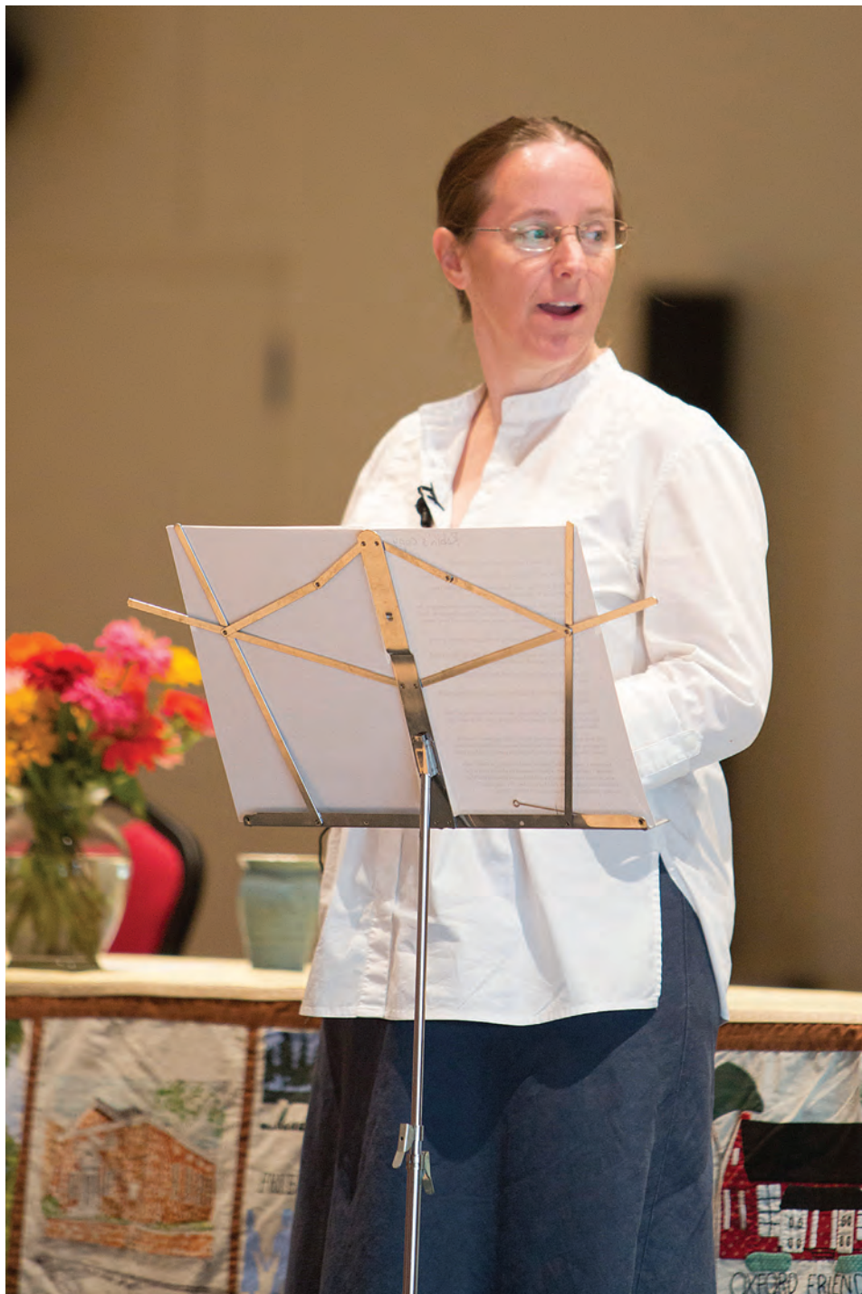
Annual Session