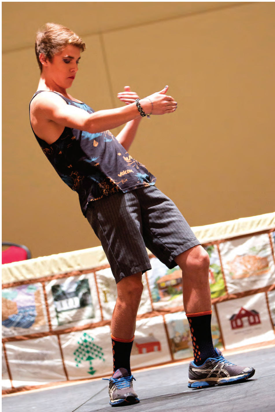
Annual Session