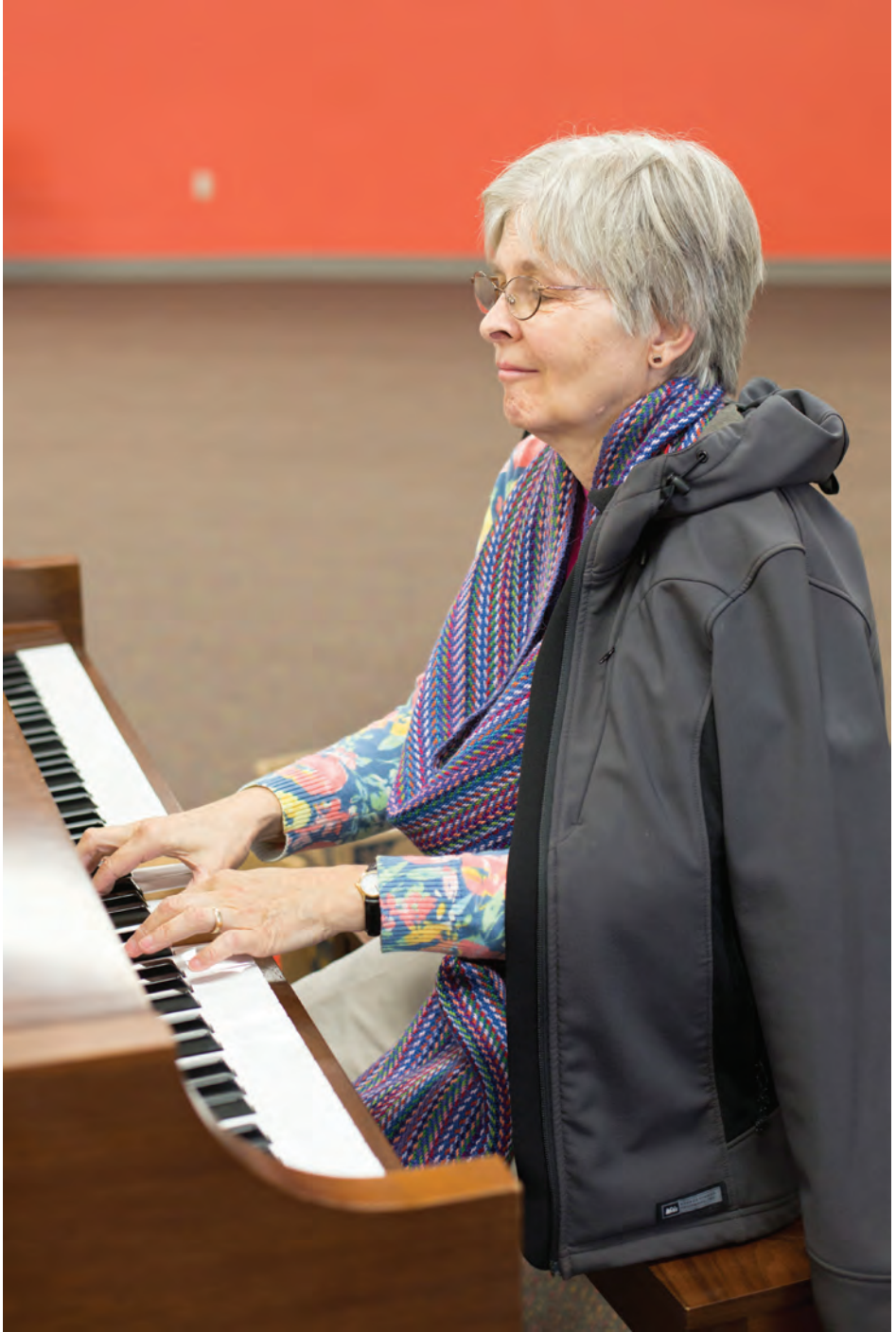
Annual Session photograph by Nony Dutton