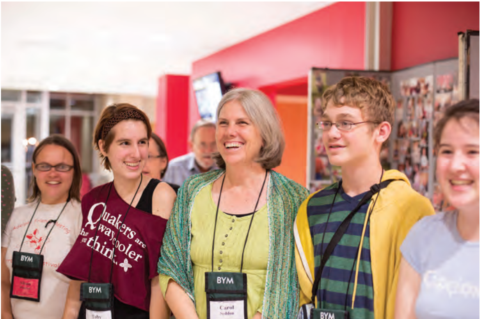
Annual Session

I2012-62 Closing Worship. The Meeting closed with a brief period of worship. God willing, Interim Meeting will next meet Third Month 23, 2013 at Little Britain Monthly Meeting.