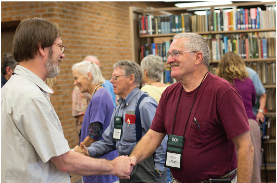
Annual Session

Y2013-93 Closing. The Clerk concluded the 342 nd Annual Session, purposing to meet again, God willing, August 4-10, 2014 at Frostburg State University.