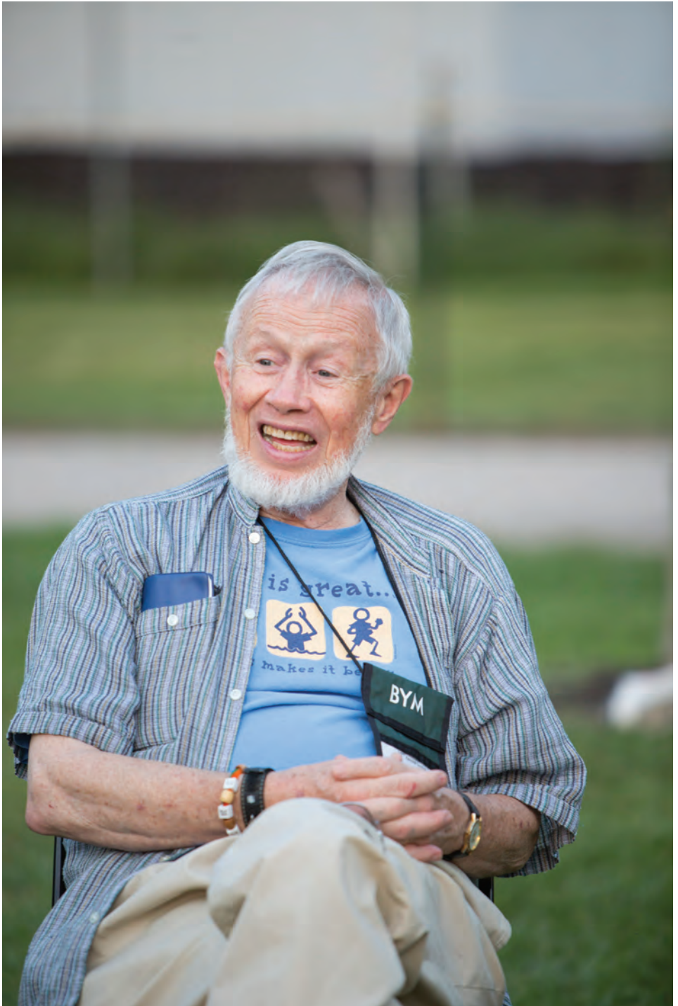
Annual Session