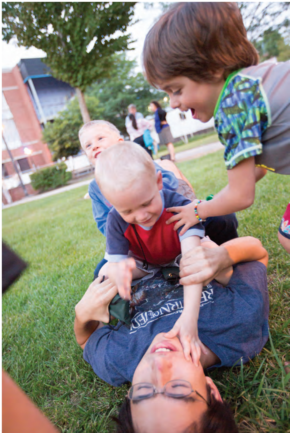
Annual Session photograph by Nony Dutton