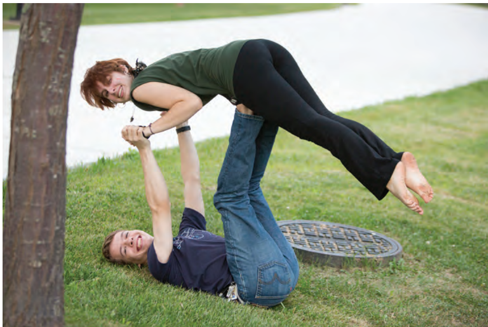
Annual Session