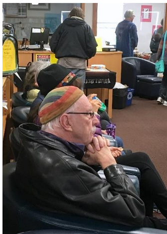
Photos Below: BYM IAC event Celebrating Native Americans Today, October 13, 2018

BYM Indian Affairs Committee was formed in 1795 out of concern for “the difficulties and distress” of Native peoples. Early Quakers welcomed Natives into their homes and treated them as equals. Some families even lived with tribes for several years at a time. Quakers lobbied Congress for Indian concerns and worked to prevent relocation of 6 Iroquois tribes farther west in early 1800s. Some Quakers later served as Indian agents for a time. We are grateful to Richmond Friends Meeting for their support of this event.