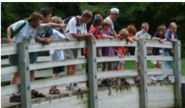
Junior Young Friends enjoying time together at Annual Session