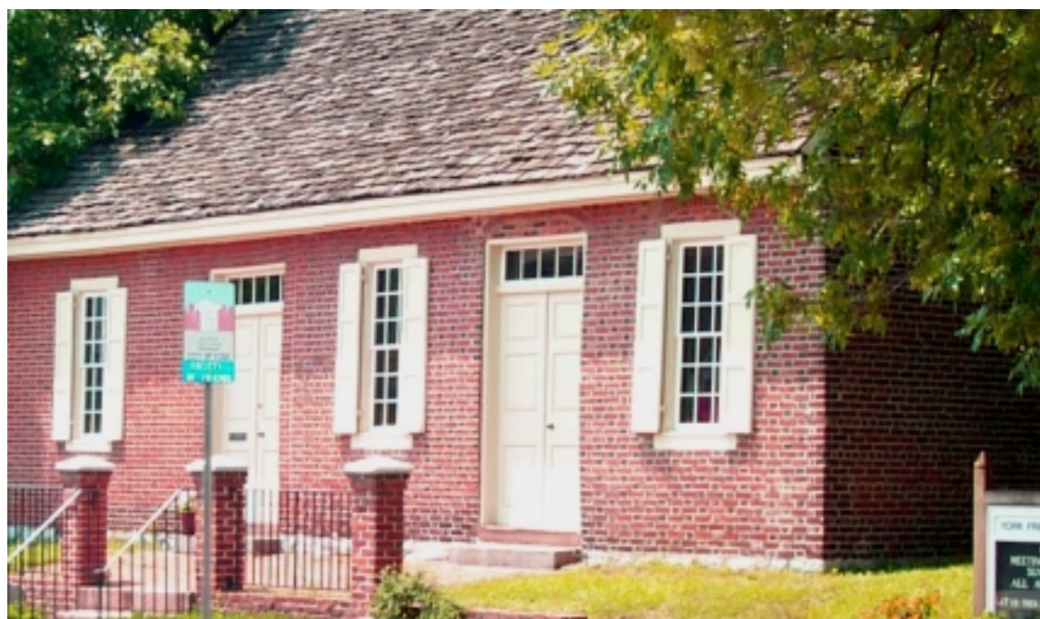
York Meeting House