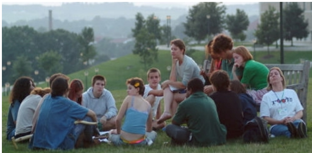
Young Friends gathering on the lawn of the James Madison University at Annual Session